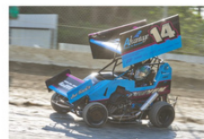
Creek County Speedway