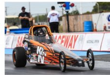
Thunder Valley Raceway Park