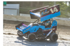
Red Dirt Raceway