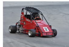
Tulsa Quarter Midget Club