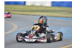
Oklahoma Motorsports Complex